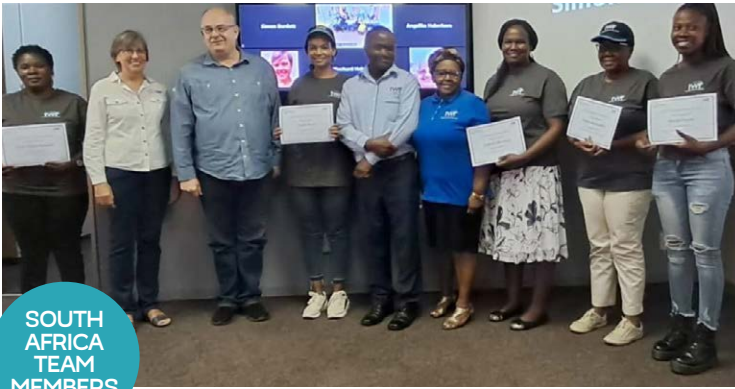
SOUTH AFRICA TEAM MEMBERS

29. Father, many women in Burundi are jobless and illiterate. Please provide employment so that women can feed their children and families. (2 Cor. 9:8)